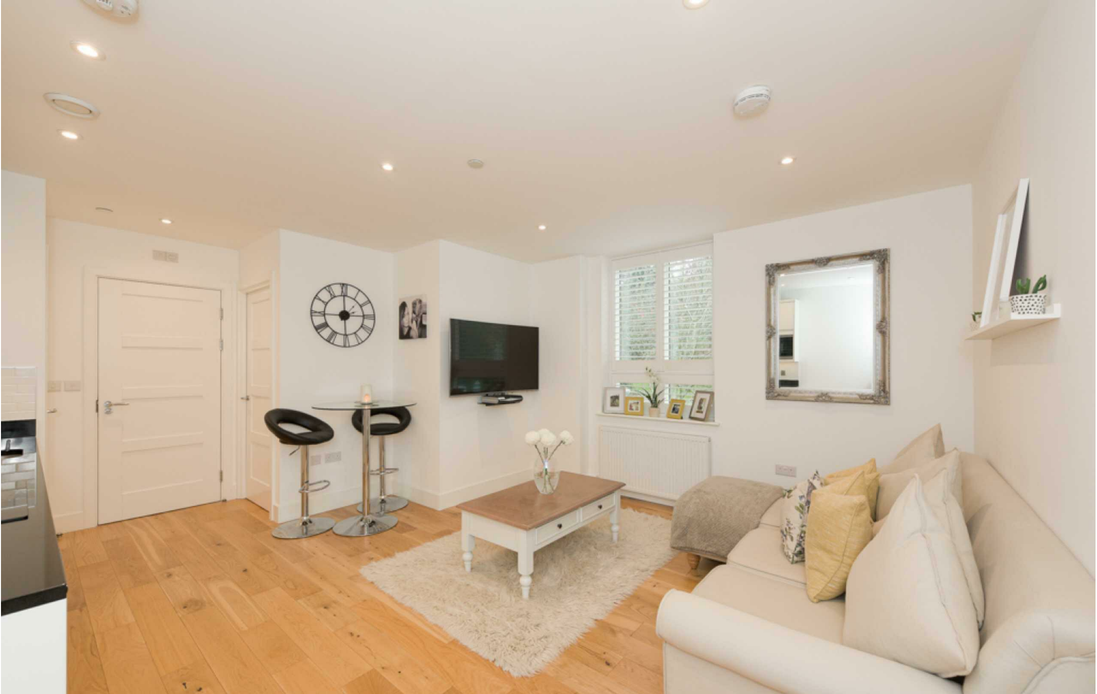
Rutland House, Epsom